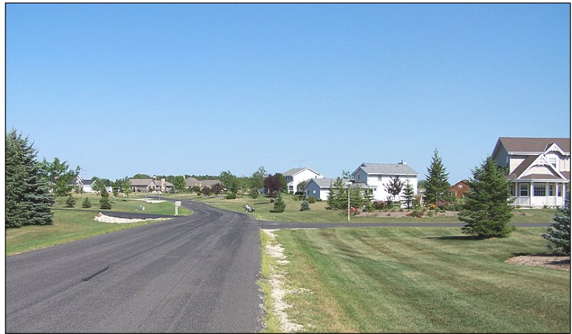
Figure 3.5 displays the increase in housing units the Town of Sherman experienced in 1980-2000. The Town mirrored the rate of Sheboygan County as a whole. Although the number of new homes averaged about 8 per year in the Town of Sherman during the 1990s, this is a slow rate when compared to places in higher growth areas such as the Town of Richfield (located in Washington County adjacent to Waukesha County), which averaged about 80 per year in the same decade.